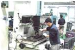
放電機(SODICK, MAKINO, JINYONG) Electrical discharge machine