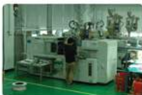
射出機 100/100/50 Ton (INJECTION)