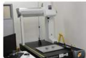
三次元測定器 3D measuring machine