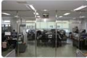
設計室 Mold design