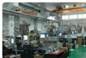
射出機 350/250/170/150/80 Ton (INJECTION)