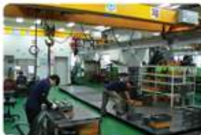
仕上げライン Finishing line No.1