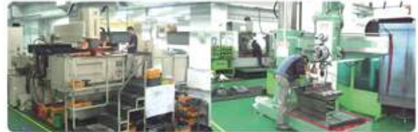
放電機(MAKINO : 1500 x 600) Electrical discharge machine