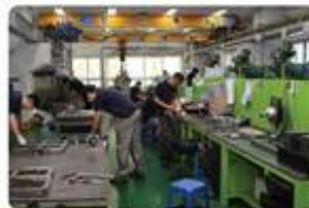
仕上げライン Finishing line No.2