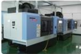
黒鉛加工機 CNC 6号機 12,000 RPM