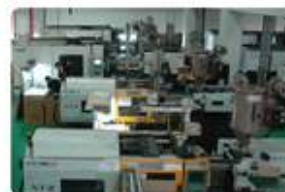
射出機 550/450/130/130 Ton (INJECTION)