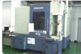
黒鉛加工機 CNC 5号機 12,000 RPM