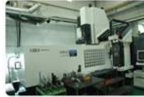
CNC マシニング センター CNC 12号機 12,000RPM