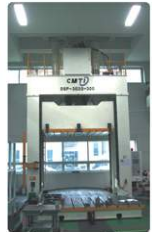
ダイスポッティングプレス (Die spotting press : 300Ton)