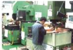
放電機(SODICK, MAKINO, JINYONG) Electrical discharge machine