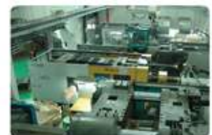
射出機 900/650/580/1300 Ton (INJECTION)