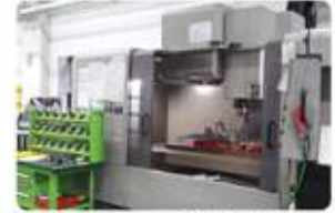
CNC マシニング センター CNC 6号機 15,000 RPM