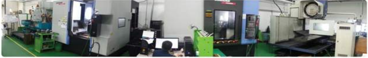
CNC マシニング センター CNC 5号機 6,000 RPM