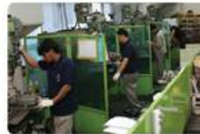
汎用ミーリング General milling machine